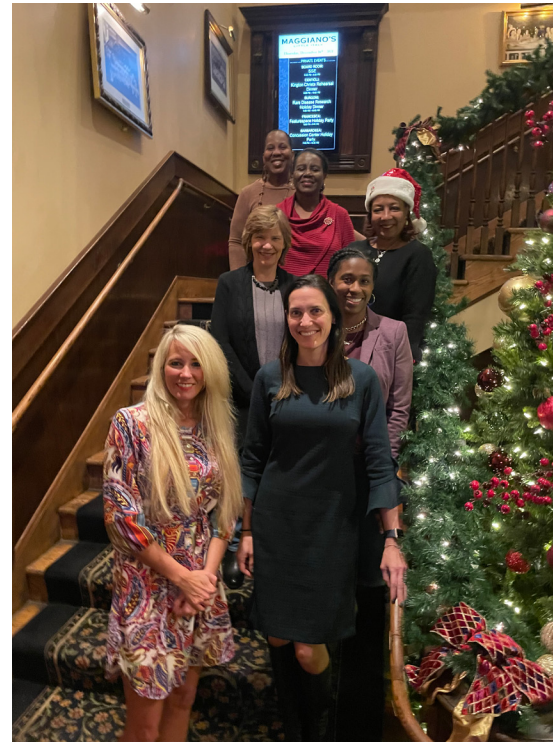
General Office board members celebrated another successful year of service with a holiday dinner at Maggiano's on December 16th.