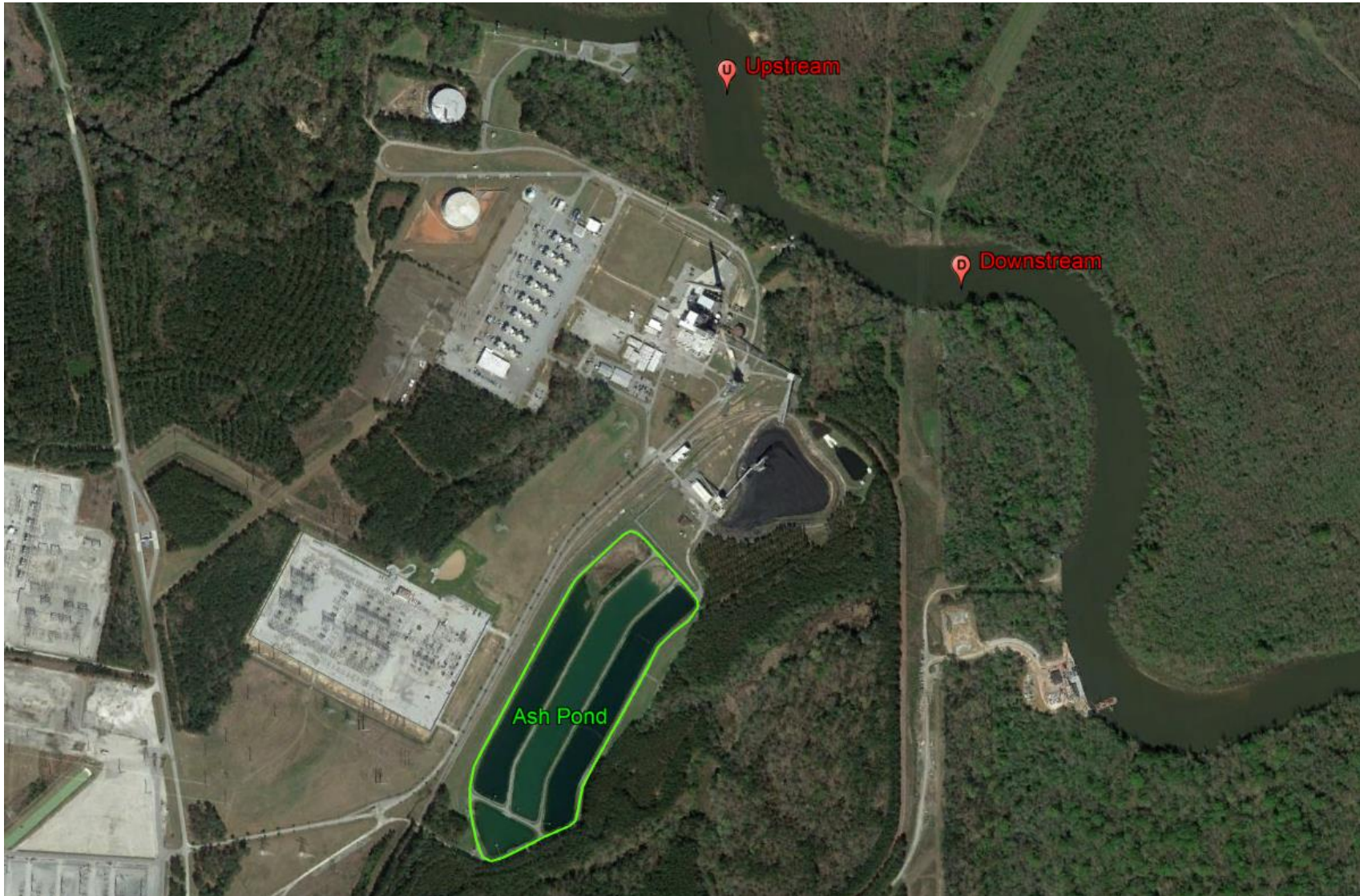
Plant McIntosh Ash Pond