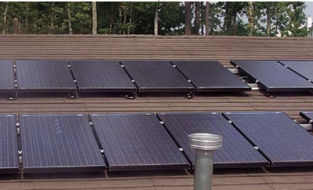
Built in 2004, Union City Fire Station No. 1 sports solar panels that were carefully positioned to make full use of the Georgia sun.

When station No. 1 opened last year, it was recognized for its progressive energy systems by Georgia Gov. Sonny Purdew. In a letter to the department, he said, "I am proud of Union City fire station No.1. As the first solar-powered fire station in Georgia, you have made a huge commitment to the environment and to energy conservation. We hope this will be one of many."