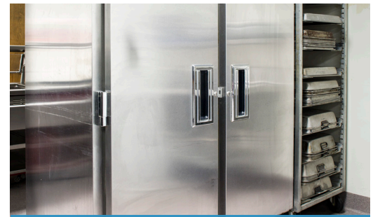
This ENERGY STAR certified holding cabinet is about 70 percent more energy efficient than standard models.*