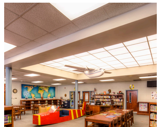
Brighter, more consistent lighting in the library at Temple Elementary makes for a better learning environment.