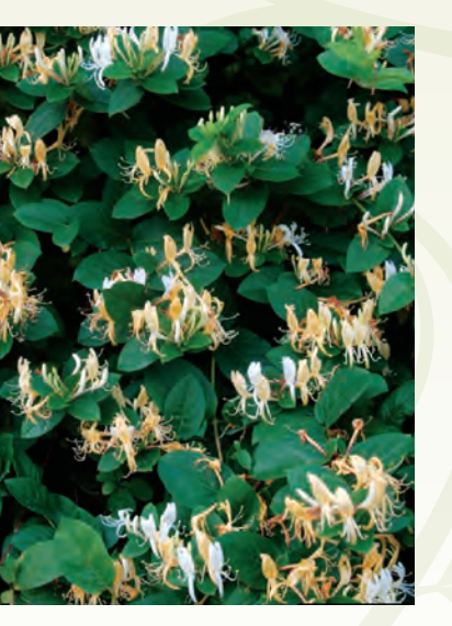
Japanese Honeysuckle

chainsaws and stumps sprayed with herbicide using backpack sprayers. Other mechanical methods for exotic species control might be successful as recommended by licensed applicators or landscape professionals.