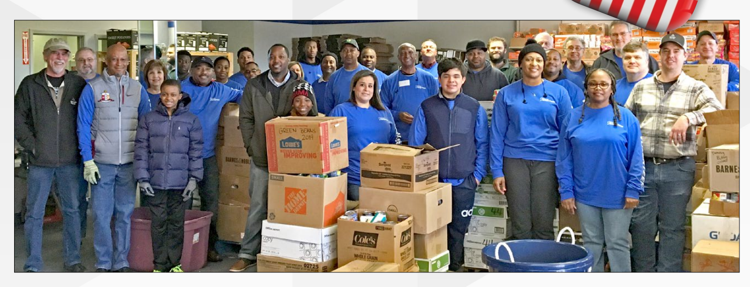
Plant Yates Chapter - Citizens members from Plant Yates sorted food at One Roof Ecumenical.

Martin Luther King Day of Service Projects