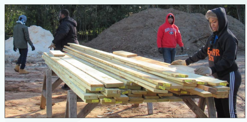
Dublin Chapter – Dublin Citizens members made sure WINGS Shelter is looking good for its residents.