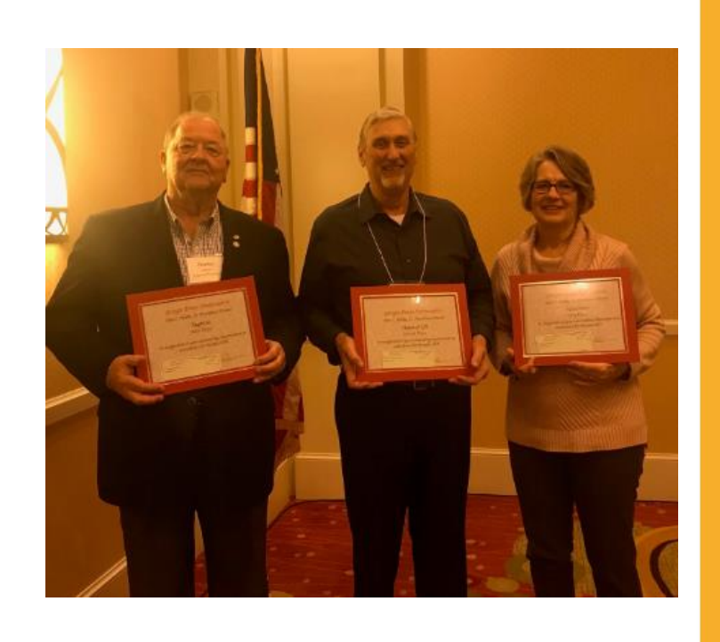
Service Hours Per Member First Place-Metro West Second Place-Southwest GA Third Place-Golden Isles