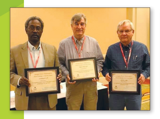
Service Hours Winners First Place-Southwest GA Second Place-Metro West Third-Golden Isles