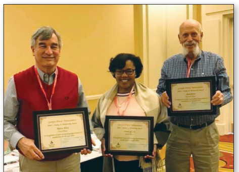
Membership Winners First Place-Metro West Second Place-Statesboro Third Place-Heart of GA