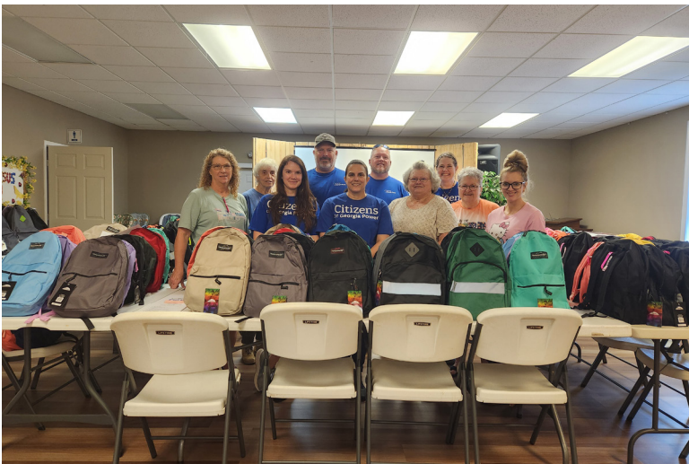
Carrollton Citizens of Georgia Power partnered with Centralhatchee First Baptist Church to pack 184 backpacks for Centralhatchee Elementary students.

Carrollton Citizens of Georgia Power partnered with Centralhatchee First Baptist Church to hand out bookbags & hotdog meals to Centralhatchee Elementary students and their families. It was a super-hot day, but it was worth it to start the kids off right for the school year. We couldn't have asked for a better group of volunteers!