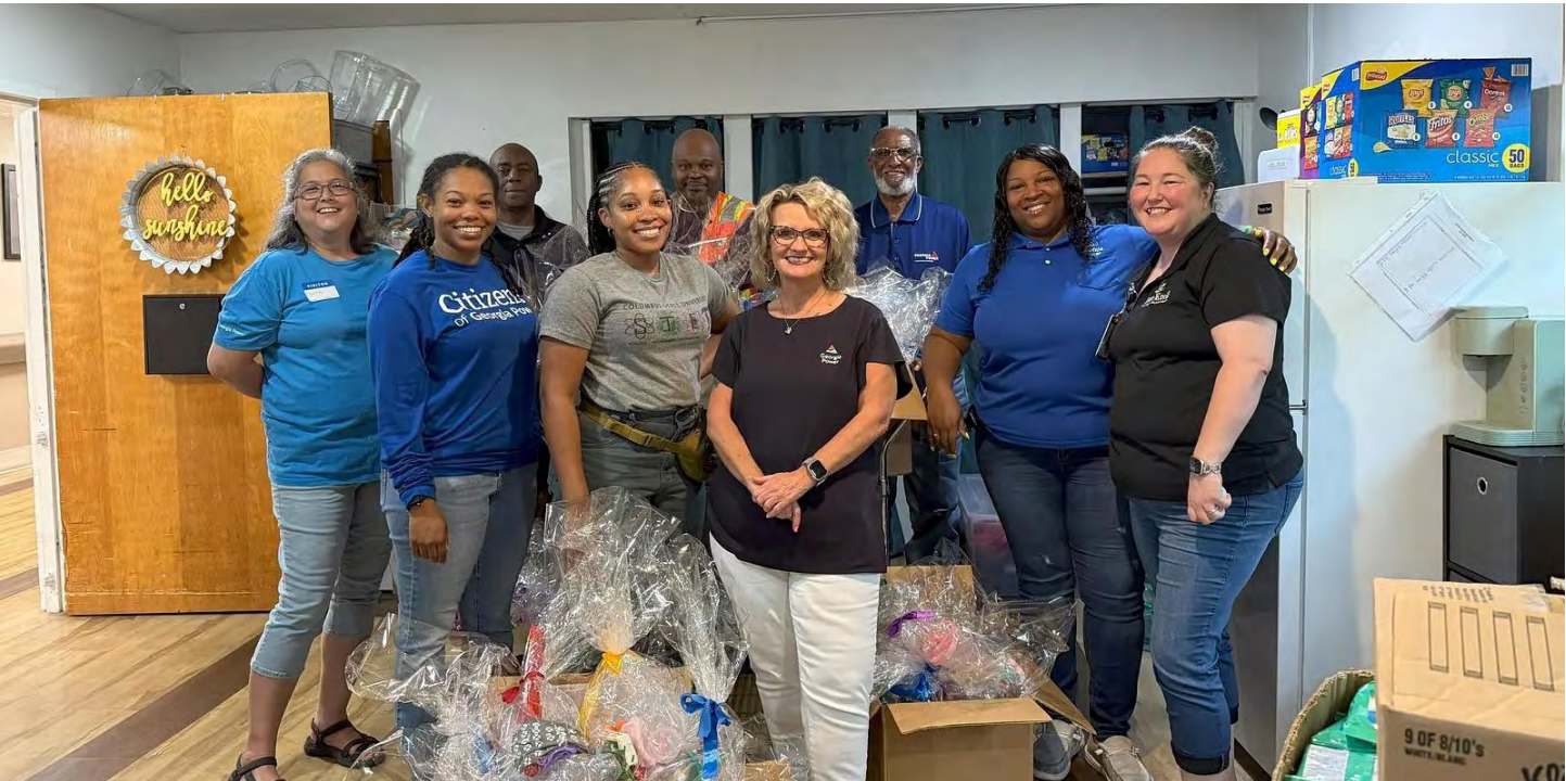
Yates Citizens volunteers lit up Pine Knoll Nursing & Rehab Center by cohosting a lively Bingo Bash and presenting winners with gift bags created by our Citizens members. The residents were thrilled to see new faces and had an absolute blast!