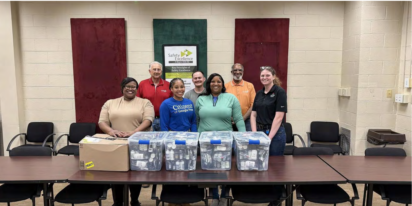
Acts of Kindness on Friday the 13th. Plant Yates volunteers came together to pack over 100 hygiene bags for kids in the Giving Hearts' summer lunch program. Thank you to everyone who made this possible. Your kindness and dedication to service is truly making a difference!