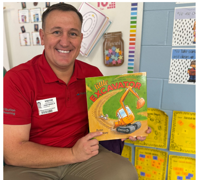
Savannah Citizens had a great turn out throughout Chatham and Effingham counties during Georgia Pre-K Week!